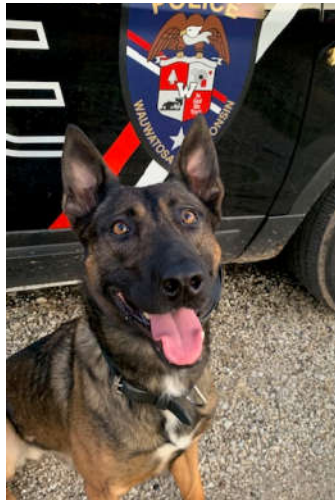
Zev is a Dutch Shepard