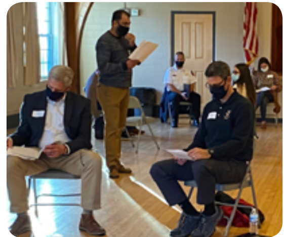
The Zeidler Group leads a facilitated group discussion about making Wauwatosa a more inclusive place.

View the video and pdf presentation on the Meeting Portal: wauwatosa.net/MeetingPortal