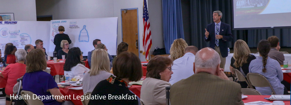
Health Department Legislative Breakfast