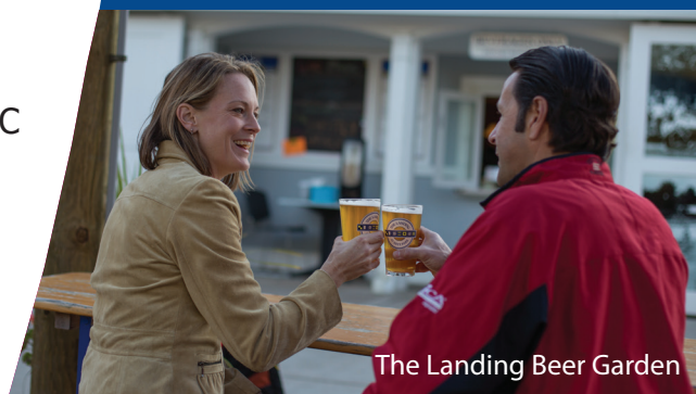
The Landing Beer Garden

December 21 * 10am - 3 pm Train Day @ Wauwatosa Public Library