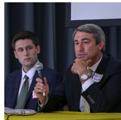
2018 Wauwatosa Legislative Breakfast